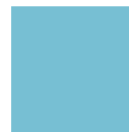
CCVO BLUE C 50 / M 8 / Y 13 / K 0 HEX #70C0D3 RGB 112, 192, 211