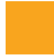
CCVO ORANGE C 0 / M 41 / Y 99 / K 0 HEX #FFA515 RGB 255, 165, 21