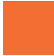
CCVO RED C 0 / M 71 / Y 89 / K 0 HEX #FF6E2E RGB 255, 110, 46

The colour palette is a key element in the CCVO identity. The colour hierarchy block seen to the right gives a sense of the overall colour usage, ranging from the dominant red and light blue to highlight yellow and blue. CCVO Aubergine is used in place of black in all CCVO instances.