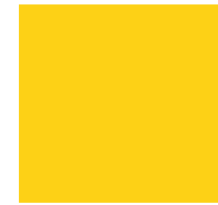
CCVO YELLOW C 1 / M 16 / Y 97 / K 0 HEX #FFD217 RGB 255, 210, 23