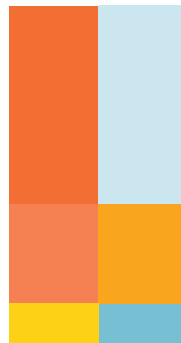
CCVO colour block